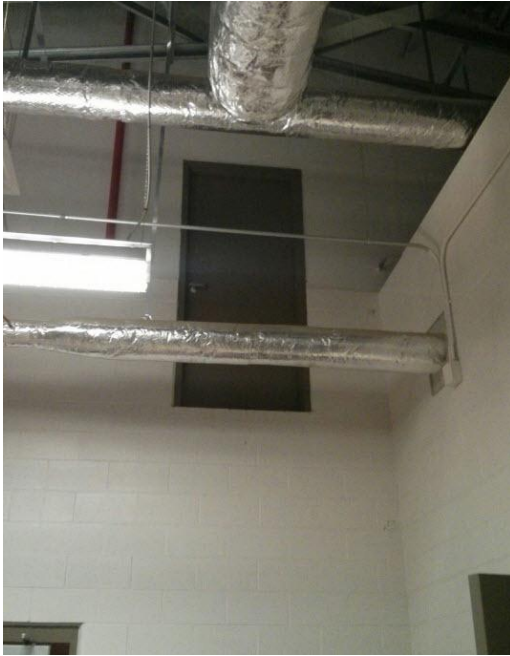
Budget Short Fall